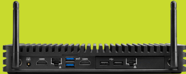
KIMERA MODULAR B REAR VIEW