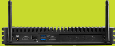
KIMERA MODULAR A REAR VIEW