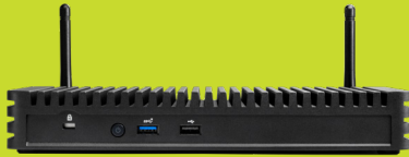
KIMERA MODULAR FRONT VIEW