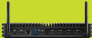
KIMERA MODULAR C REAR VIEW